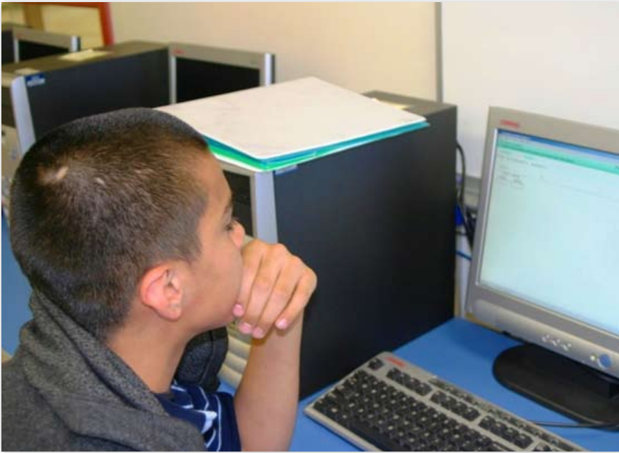
Dixon Center student logging in to retrieve his lesson assignments.

She also credits A+LS for an improvement in attendance and overall behavior issues.