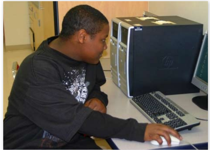
Student working on an assignment at the Dixon Center.

“Before we went with A+ ,” says Dixon, “we were using all kinds of things. It was a big hassle. Now we have a uniform reporting system, which is great.”